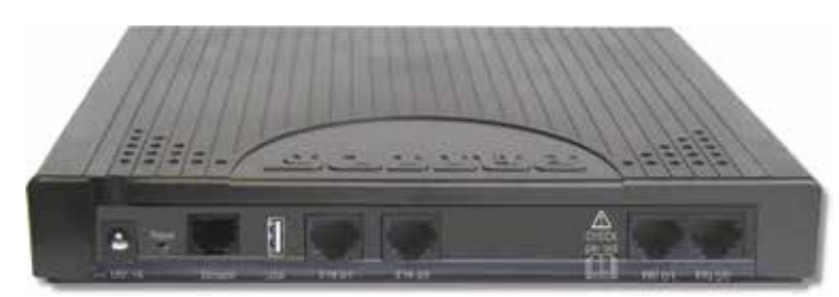
2-Ethernet-port upgradeable option